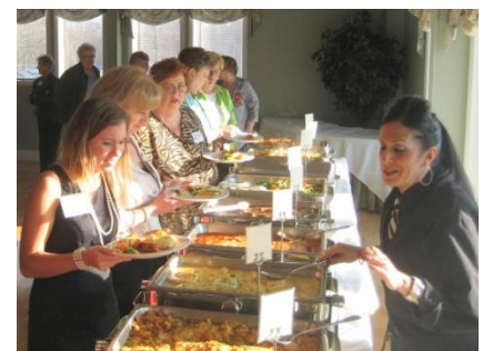
Service with a smile; so much good food to choose from.